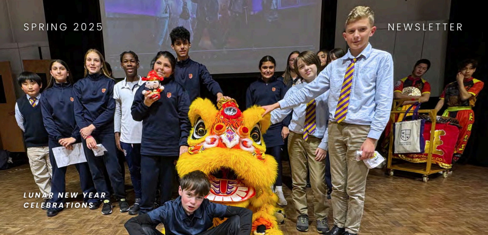
LUNAR NEW YEAR CELEBRATIONS